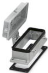
HEAVYCON B24 panel mounting base, for double locking latch, height: 29 mm, with plastic cover, with flat gasket

Please be informed that the data shown in this PDF Document is generated from our Online Catalog. Please find the complete data in the user's documentation. Our General Terms of Use for Downloads are valid ( http://phoenixcontact.com/download )