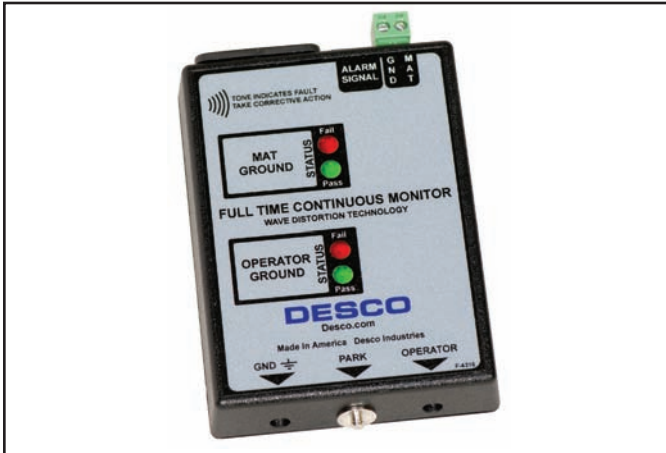
Figure 1. Desco Full-Time Continuous Monitor