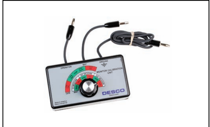
Figure 7. Desco 98220 Single-Wire Monitor Calibration Unit

Because of the impedance sensing nature of the test circuit, special equipment is required for calibration. We recommend that calibration be performed annually, using the Desco 98220 Single-Wire Monitor Calibration Unit. This Calibration Unit is a most important product which allows the customer to perform NIST traceable calibration on Desco single-wire continuous monitors. It is designed to be used on the shop floor at the workstation, virtually eliminating downtime, verifying that the continuous monitor is operating within tolerances.