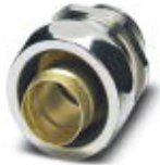
Cable gland made from brass with Pg thread, IP65 protection

Screw connection - WP-G BRASS IP65 PG21 - 3241055