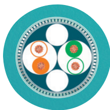
PUR ETHERNET 2x2 FLEX [93E]