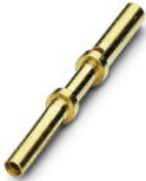
Crimp contact, turned, Contact diameter: 0.6 mm, Crimp range: 0.34 mm 2 ...0.5 mm 2

Please be informed that the data shown in this PDF Document is generated from our Online Catalog. Please find the complete data in the user's documentation. Our General Terms of Use for Downloads are valid ( http://download.phoenixcontact.com )