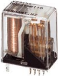
KAMMRELAIS ®, contact B 110, size 2, low-level contact, 4 PDTs, input voltage 24 V AC

Please be informed that the data shown in this PDF Document is generated from our Online Catalog. Please find the complete data in the user's documentation. Our General Terms of Use for Downloads are valid ( http://phoenixcontact.com/download )