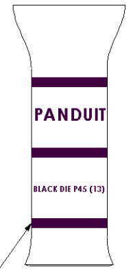
Color coded barrel markings