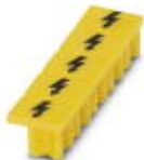
Warning cover, 5-pos., for terminal width: 5.2 mm

Zack Marker strip, flat - ZBF 5 CUS - 0825025