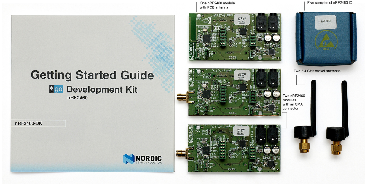
Figure 1. Kit content

The nRFgo compatible nRF2460 Development Kit contains the hardware, software and documentation components outlined in sections 2.2 and 2.3 .