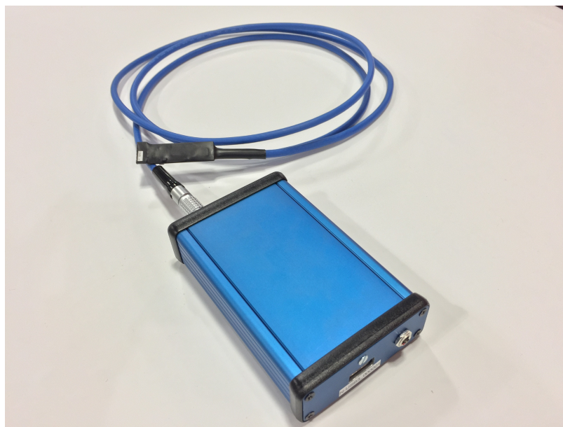
Figure 2: Nano HDMI

The NanoHDMI is pre-calibrated by AWAIBA to the NanEye® camera head purchased together with the NanoHDMI unit for optimal FPN correction and colour balancing.