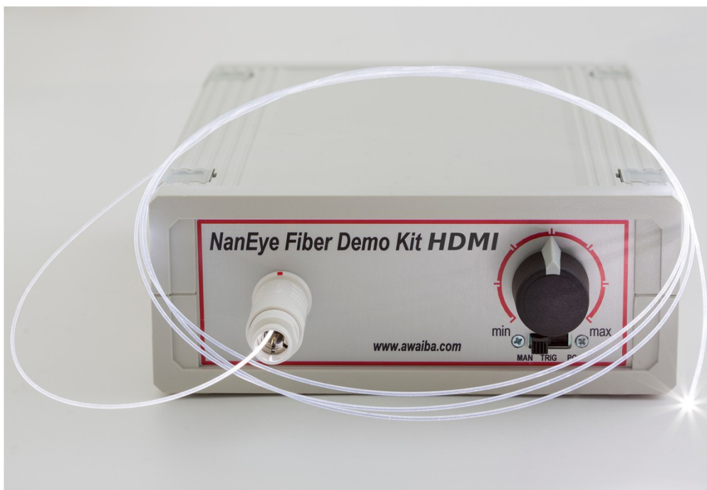
Figure 1: NanEye Fiber Demo with HDMI

The kit unit embeds advanced image processing algorithms to correct sensor fixed pattern noise, construct the colour data from the raw binary stream and displays an output image of 750 x 750 pixels over an HDMI interface. The Kit includes a fiber light source which provides light to the tip of the NanEye Sensor probe via a 0.5mm plastic optic fiber. The fiber and NanEye camera are housed in a 3mm diameter lumen of 1.4m length which can be plugged and unplugged easily from the processing and illumination unit. The illumination intensity is adjustable by a manual dial. The unit is supplied by a 15V wall charger and provides galvanic isolation to the camera head. It can interface to any standard Monitor that provides HDMI input. The compact main body of the kit measures only 40cm x 8cm x 5cm and provides all necessary video processing and display driving plus the adjustable illumination!