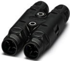
H distributor, QUICKON connection, No. of pos.: 3+PE, 0.5 mm 2 ... 1.5 mm 2 , 690 V, 17.5 A, black

Please be informed that the data shown in this PDF Document is generated from our Online Catalog. Please find the complete data in the user's documentation. Our General Terms of Use for Downloads are valid ( http://phoenixcontact.com/download )