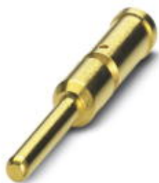
Crimp contact, turned, Contact diameter: 2 mm, Crimp range: 2.5 mm 2 ...4 mm 2

Please be informed that the data shown in this PDF Document is generated from our Online Catalog. Please find the complete data in the user's documentation. Our General Terms of Use for Downloads are valid ( http://phoenixcontact.com/download )