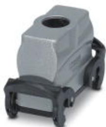
HEAVYCON B16 coupling housing, with double locking latch, height: 70.5 mm, with 1 x M32 thread, straight cable outlet

Please be informed that the data shown in this PDF Document is generated from our Online Catalog. Please find the complete data in the user's documentation. Our General Terms of Use for Downloads are valid ( http://phoenixcontact.com/download )