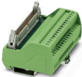
VARIOFACE termination board, to transmit max. 16 channels, only in connection with FLKM 50-PA-SLC 500 OUT/2 A

Please be informed that the data shown in this PDF Document is generated from our Online Catalog. Please find the complete data in the user's documentation. Our General Terms of Use for Downloads are valid ( http://phoenixcontact.com/download )