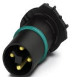
Flush-type connector, Power, 4-position, Plug, straight, T power, PCB mounting, THR solder connection

Please be informed that the data shown in this PDF Document is generated from our Online Catalog. Please find the complete data in the user's documentation. Our General Terms of Use for Downloads are valid ( http://phoenixcontact.com/download )