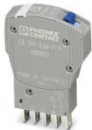
Thermomagnetic device circuit breaker, 1-pos., tripping characteristic F1 (fast-blow), 1 PDT contact, plug for base element.

Please be informed that the data shown in this PDF Document is generated from our Online Catalog. Please find the complete data in the user's documentation. Our General Terms of Use for Downloads are valid ( http://download.phoenixcontact.com )