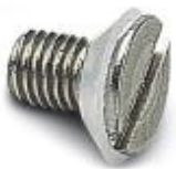
Sealing screw, for IP65 protection

Sealing screw - HC-D 7-DS-IP65 - 1686229