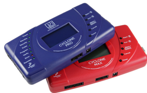
Cyclone PRO & Cyclone MAX

The USB Multilink Universal and Universal FX are intended for development and are not designed to accommodate the demands of production programming. However, P&E's Cyclone programmers are specifically engineered to withstand the rigors of a production environment and will provide a seamless transition from the Multilink. More information is available online at pemicro.com/cyclonepro and pemicro.com/cyclonemax .