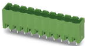
The figure shows a 10-position version of the product

PCB headers, nominal current: 12 A, number of positions: 3, pitch: 5.08 mm, color: orange, contact surface: Tin, mounting: Wave soldering