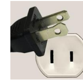
Plug Type A (North America)