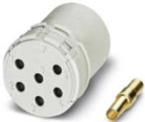
Contact insert, Number of positions: 7, Type of contact: Socket, Crimp connection

Please be informed that the data shown in this PDF Document is generated from our Online Catalog. Please find the complete data in the user's documentation. Our General Terms of Use for Downloads are valid ( http://phoenixcontact.com/download )