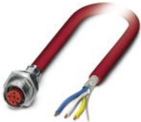
Bus system flush-type socket, CC-Link, 4-pos., M12, SPEEDCON, shielded, rear/screw mounting with Pg9 thread, with 2.0 m bus cable

Please be informed that the data shown in this PDF Document is generated from our Online Catalog. Please find the complete data in the user's documentation. Our General Terms of Use for Downloads are valid ( http://download.phoenixcontact.com )