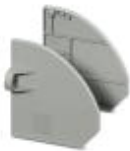
Flange cover, Color: gray