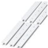
Zack marker strip, Strip, white, Unlabeled, Can be labeled with: Plotter, Mounting type: Snap into tall marker groove, For terminal block width: 20.3 mm, Lettering field: 10.5 x 20.25 mm

Zack marker strip - ZB 20,3:UNPRINTED - 0820248