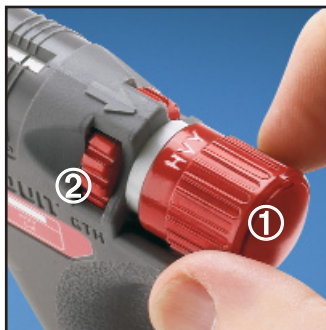
① Coarse Adjustment Knob ② Fine Adjustment Knob

Step 2: Use Fine Adjustment Knob to set and maintain desired tension