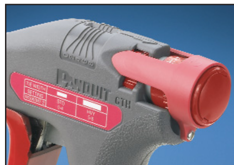
Optional Tension Lockout Kit