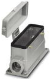
HEAVYCON box mounting base B24, for double locking latch, height 67 mm, with support 1xM25, with cover

Please be informed that the data shown in this PDF Document is generated from our Online Catalog. Please find the complete data in the user's documentation. Our General Terms of Use for Downloads are valid ( http://phoenixcontact.com/download )