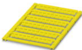
The figure shows the UCT-TMF 6 version

UniCard materials for thermal transfer printers, for labeling Weidmüller, Conta Clip, and Klemsan terminal blocks with horizontal marker groove, 60-section, can be labeled with THERMOMARK CARD and BLUEMARK LED, color: yellow