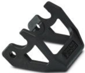
Double locking latch for B10 / B16 / B24 housing, HC-EVO....AL and HC-STA....AL

Please be informed that the data shown in this PDF Document is generated from our Online Catalog. Please find the complete data in the user's documentation. Our General Terms of Use for Downloads are valid ( http://phoenixcontact.com/download )