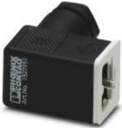
Valve connector, 3-pos., type C, unconnected, screw connection, cable screw connection Pg7

Please be informed that the data shown in this PDF Document is generated from our Online Catalog. Please find the complete data in the user's documentation. Our General Terms of Use for Downloads are valid ( http://download.phoenixcontact.com )