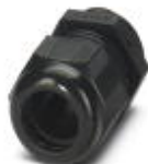
Cable gland, cable gland material: PA, external cable diameter 6 mm ... 12 mm, shielding: no, connecting thread: M20 x 1.5, color: jet black RAL 9005

Cable gland - G-INS-M20-S68N-PNES-BK - 1411133