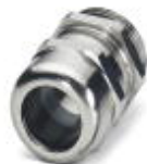
Cable gland, cable gland material: Nickel-plated brass, external cable diameter 6 mm ... 12 mm, shielding: no, connecting thread: M20 x 1.5, color: silver, with O-ring

Cable gland - G-INS-M20-S68N-NNES-S - 1411163