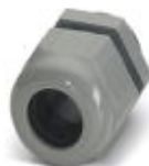
Cable gland, cable gland material: PA, external cable diameter 6 mm ... 12 mm, shielding: no, connecting thread: M20 x 1.5, color: silver-gray RAL 7001

Cable gland - G-INS-M20-S68N-PNES-GY - 1411125