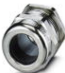
Metal screw connection up to 5 bar, thread length: 6 mm, cable diameter: 11 - 16 mm, WAF 27, screw connection: M20

Cable gland - HC-M-KV-M20(11-16) - 1645998