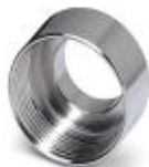
Step-up adapter, M20 to M25, including O-ring

Extension adapter - ENLAR-M-KV-M20/M25 - 1647666