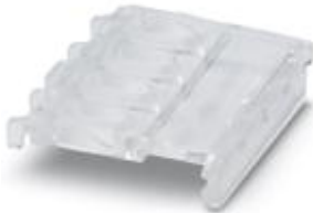
Ejector for COMBICON plug

Please be informed that the data shown in this PDF Document is generated from our Online Catalog. Please find the complete data in the user's documentation. Our General Terms of Use for Downloads are valid ( http://phoenixcontact.com/download )