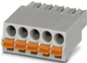
Figure shows the 5-pos. version

Plug component, Nominal current: 8 A, Number of positions: 4, Pitch: 3.5 mm, Connection method: Push-in spring connection, Color: light gray, Contact surface: Tin