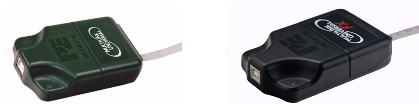
Figure 8-1: Multilink Universal (left) & Multilink Universal FX (right)