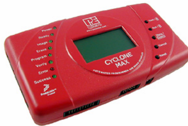
Figure 8-2: P&E's Cyclone MAX