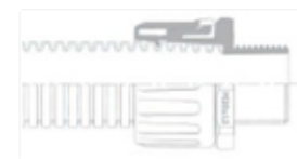
Conduit complete with FPA fitting