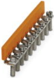
Fixed bridge, pitch: 8.2 mm, number of positions: 10, color: silver

Please be informed that the data shown in this PDF Document is generated from our Online Catalog. Please find the complete data in the user's documentation. Our General Terms of Use for Downloads are valid ( http://phoenixcontact.com/download )